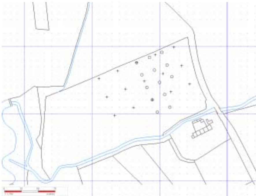
Location showing grid corners. (resistivity - ●, magnetometry - +).

(All images following are orientated with north to the top of the page)