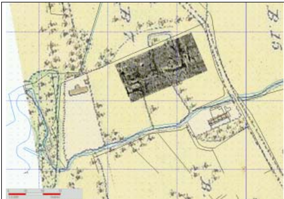
Magnetometry survey superimposed on 1815 map and current map features.