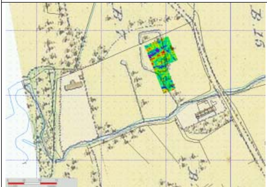
Resistivity survey superimposed on 1815 map and current map features.